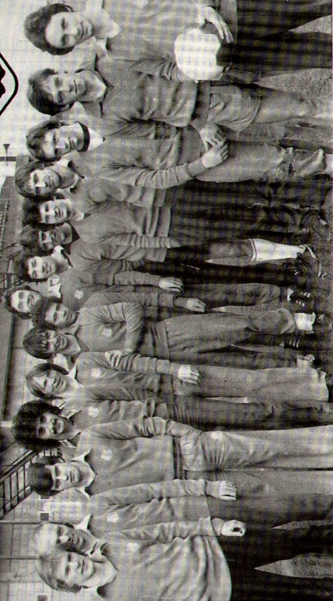
A break from training.....as members of The Stadium first-team squad show off their new club sweaters — The Club Shop at Grosvenor Street still has a few [various sizes] sweaters in stock; orders yours now!!!