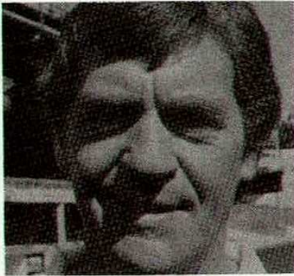
LAWRIE McMENEMY Southampton Manager